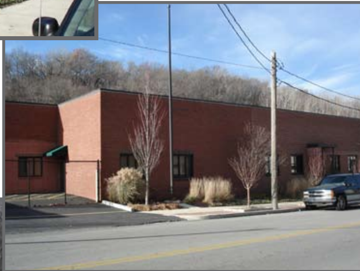
3242 Roanoke Road