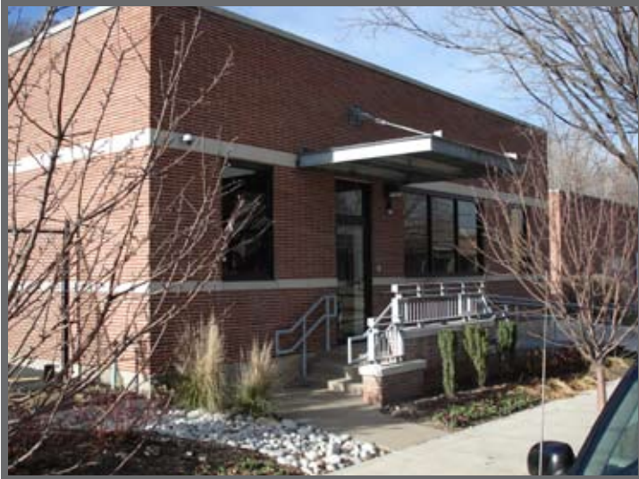
3232 Roanoke Road