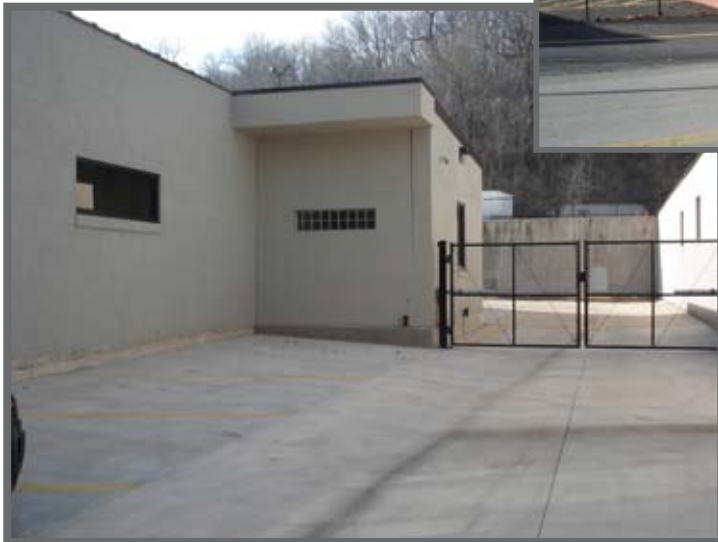
3232 Roanoke Road Gated Parking Area

For more information or to schedule a tour, give us a call.